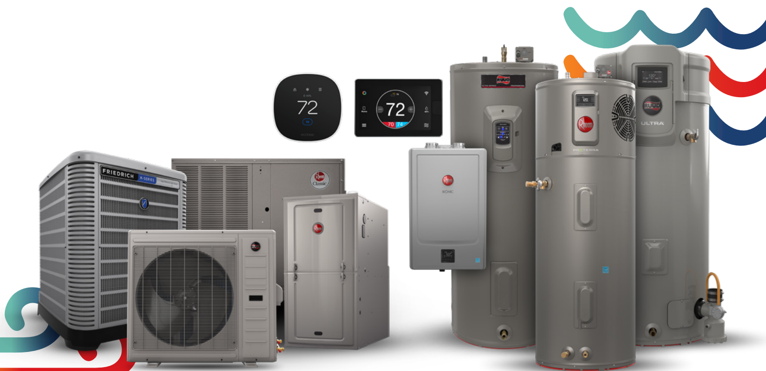
Heating & Cooling